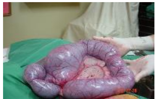
Pyometra (a uterus filled with pus)

We can spay your female while she is young and healthy and an excellent surgical candidate or we can wait until a problem develops and the procedure has to be done as an emergency on a less than ideal surgical candidate. The latter increases the risk of anaesthesia and surgery, not to mention the cost to you.