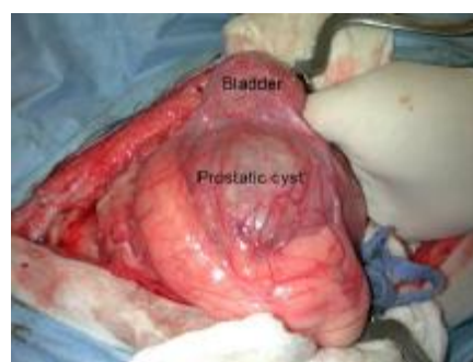
A canine prostatic cyst evident on a radiograph and then at surgery.